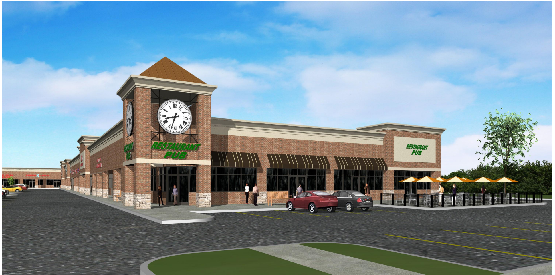
Proposed New Addition (Van Dyke)