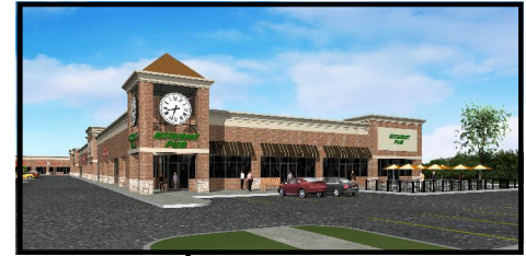
Proposed New Addition (Van Dyke)