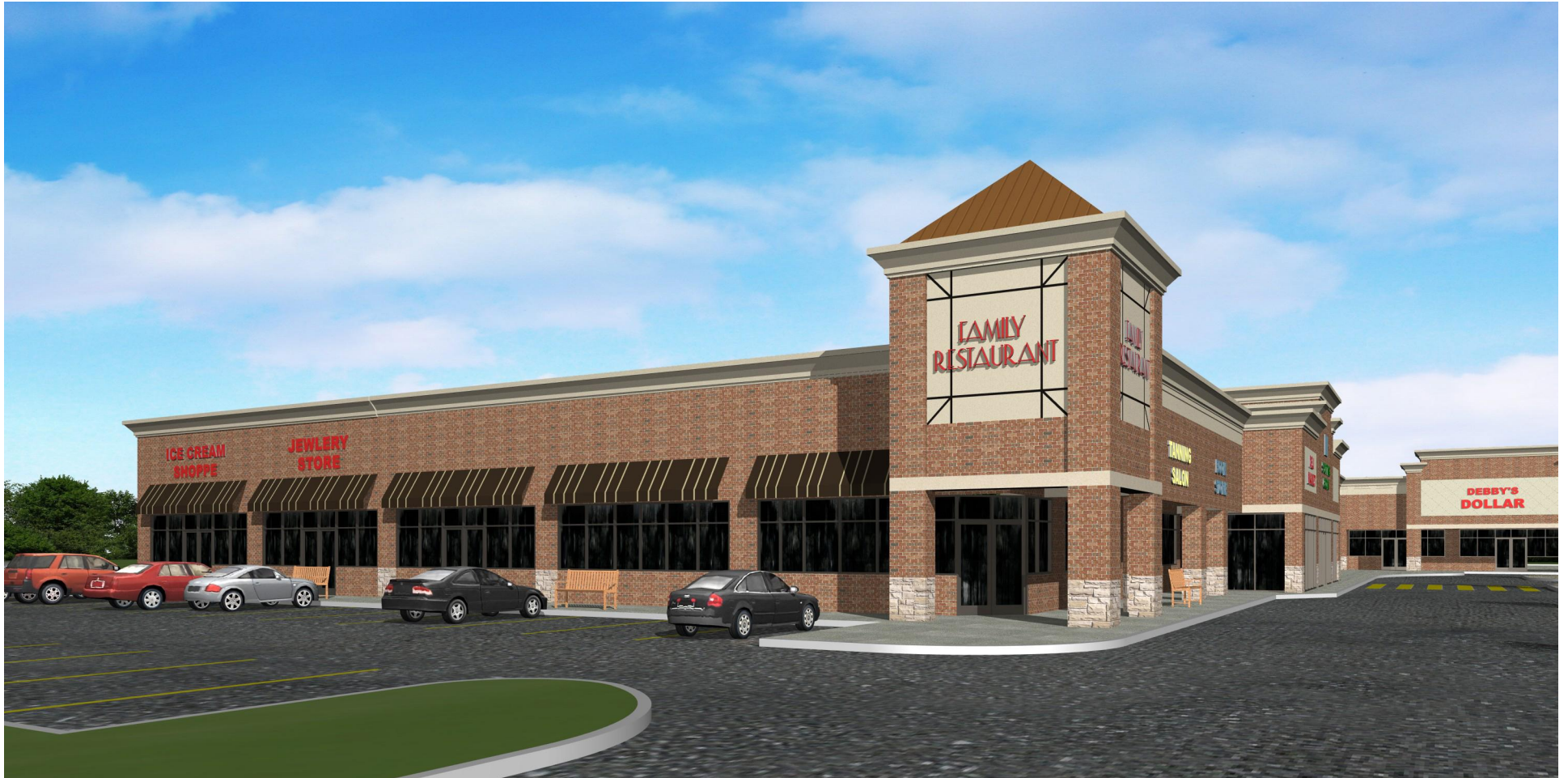
Proposed New Addition (27 Mile Rd)