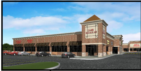
Proposed New Addition (27 Mile Rd.)